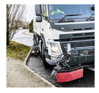
Side sliding brush unit Sweep at a distance by extending the brush and suction nozzle.