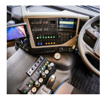
Complete control Adjust your sweeping equipment with the ergonomic, built-in panel.