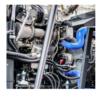
High capacity fan High performance & payload. Low fuel consumption and noise level.