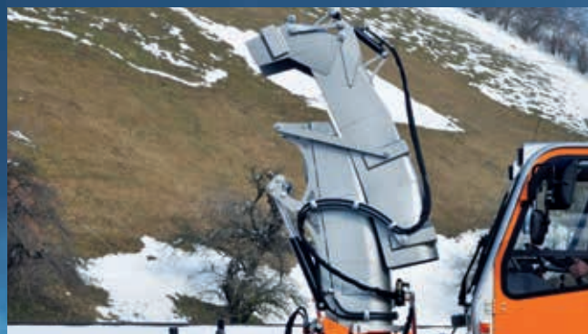
Rolba R600 with telescopic ejection chute.