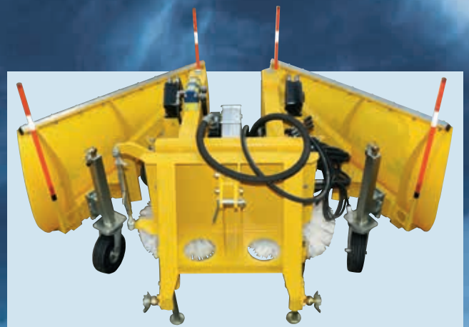
Simple attachment to tractors and wheel loaders.