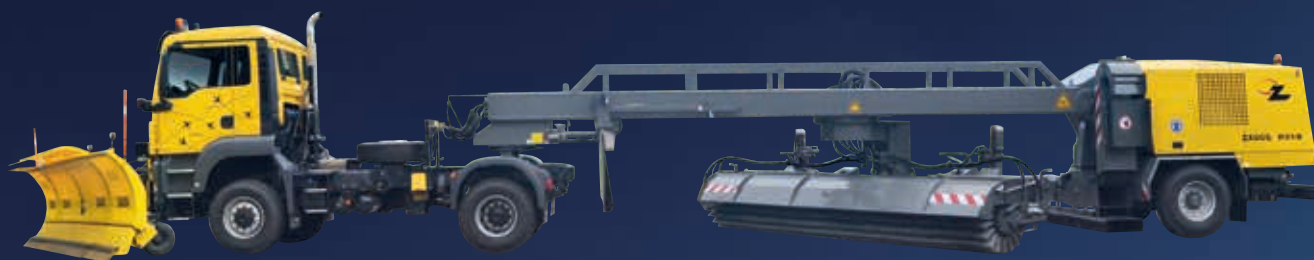
P21 S snow sweeper – Towed snow sweeper with outstanding area performance thanks to wide brush.

Powerful ZAUGG snow sweepers ensure the clearance of runways and other air-side manoeuvring areas – quickly, efficiently and with Swiss precision. With operating speeds of over 40 km/h the necessary clearing performances are achieved. Whether for the clearance of snow, slush, ice or dirt in winter or for blowing away dirt in the summer – the snow sweepers from ZAUGG are suitable in every respect. These highly efficient airport devices are available with working widths of over 6 m and in towed versions or permanently installed on a modified truck chassis.