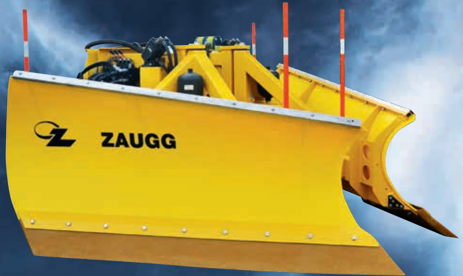
SnowShark adjustable wedge-shaped plough.