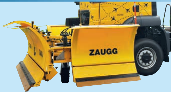
Folding sides: The 7.5 and 8 metres wide versions are also available with folding side blades.