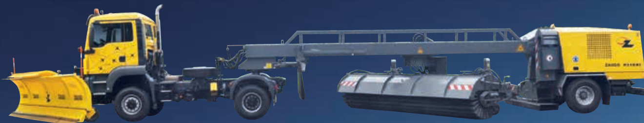
P21 SXL snow sweeper – Towed snow sweeper with special large brush for use at large airports.