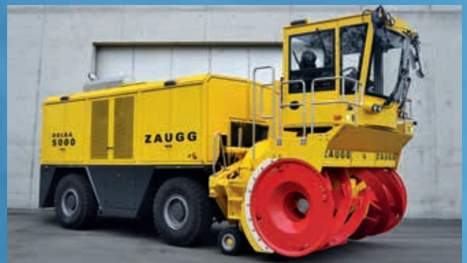
The reconceived Rolba R5000 from ZAUGG.