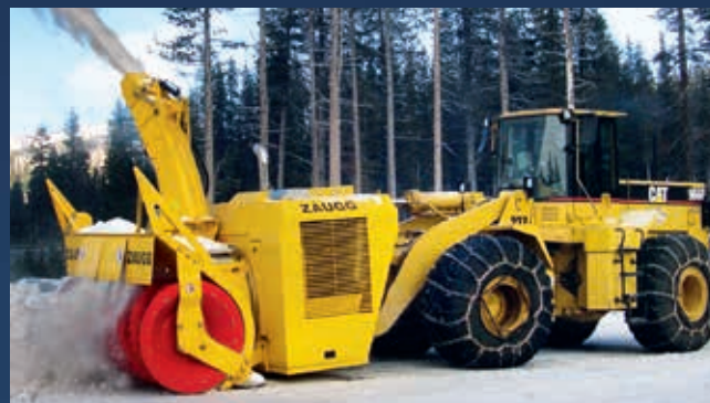
ZAUGG Monobloc MB570.