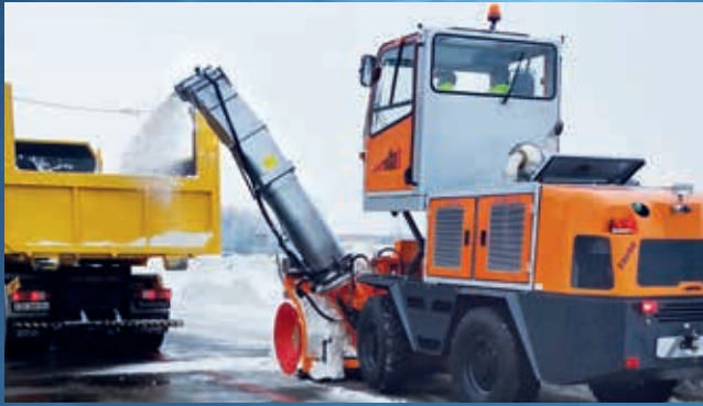
ZAUGG Rolba loading snow onto a truck.