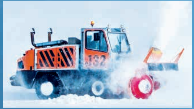
Rolba R3000 in operation at an airport.