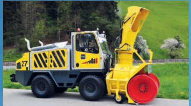
ZAUGG Rolba with customer-specific paintwork.