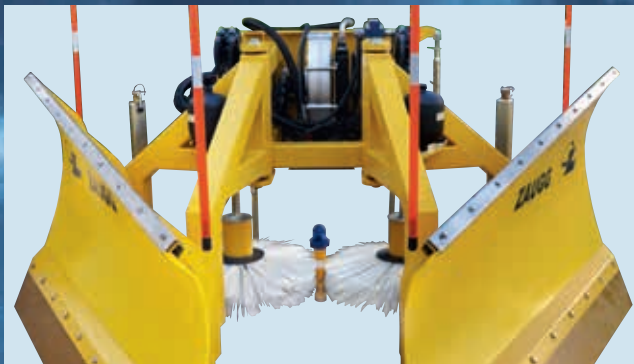
The brush/blower technology. The blower is available as an option.