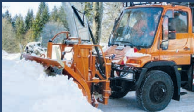
SF 90-110 on a municipal implement carrier.