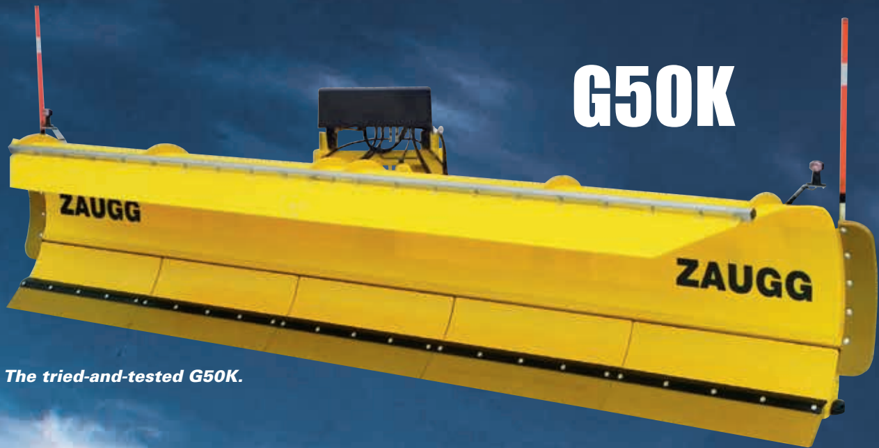
The tried-and-tested G50K.

The G50K is the product of ZAUGG's many years of know-how. The plastic plate and the unconventional closed shape achieve a nice, rolling and efficient flow of snow and optimum ejection. The G50K is mainly used at airports and on motorways and main roads.