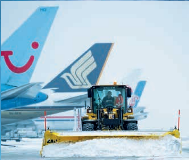
Very well suited for attachment to trucks, wheel loaders and tractors.