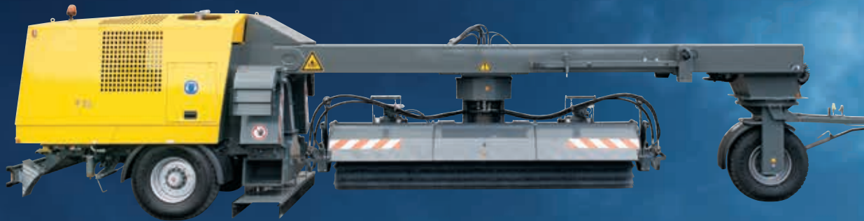
P21 as trailer for a truck, tractor or other tractive units.