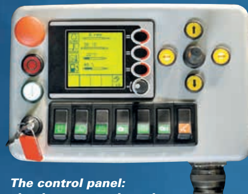
The control panel: simple, ergonomic and self-explanatory.