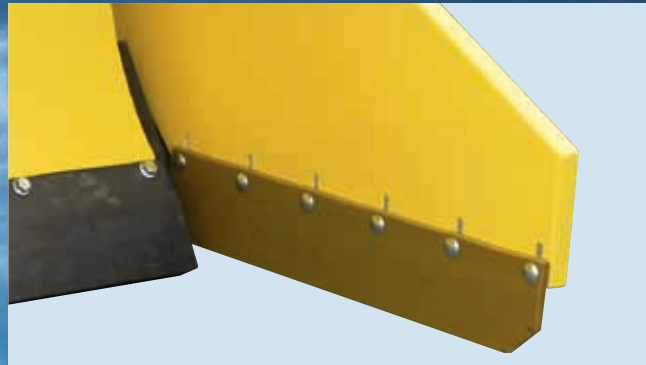
Optional hydraulically adjustable side plate.