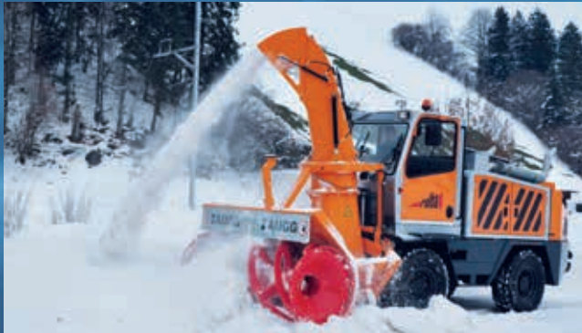
ZAUGG Rolba with 2-stage snow blowing system.