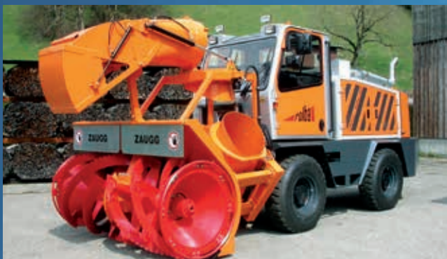
Rolba R3000 with the direct ejection option.