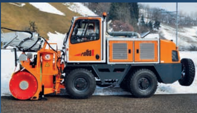
Rolba R600 with ZAUGG snow blower.