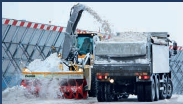
ZAUGG Monobloc MB350 with telescopic chute loading snow onto a truck.