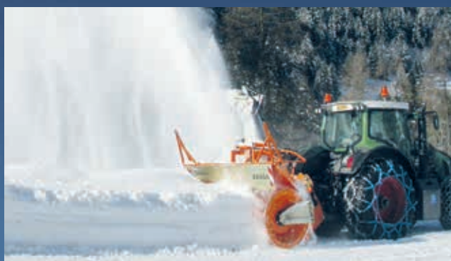
SF 110 – Thanks to the revolving impeller housing, the snow can be directly ejected to the left or right.