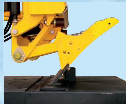
ZAUGG obstacle ride over safety system.